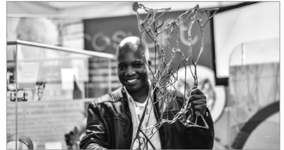
Presenting the optimized design