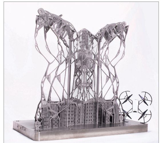
3D printed optimized UAV frame