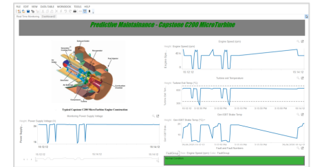
Gas Turbine Predictive Maintenance