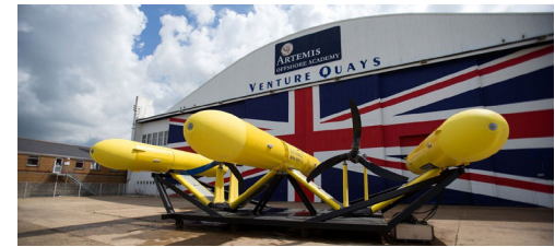
Two (1st gen) SITs mounted on PLAT-O at full scale