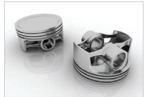
Final rendering of piston in solidThinking Evolve prior to manufacturing