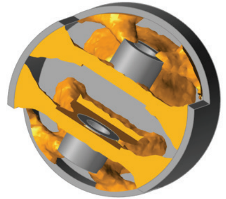
Ideal piston concept generated in solidThinking Inspire