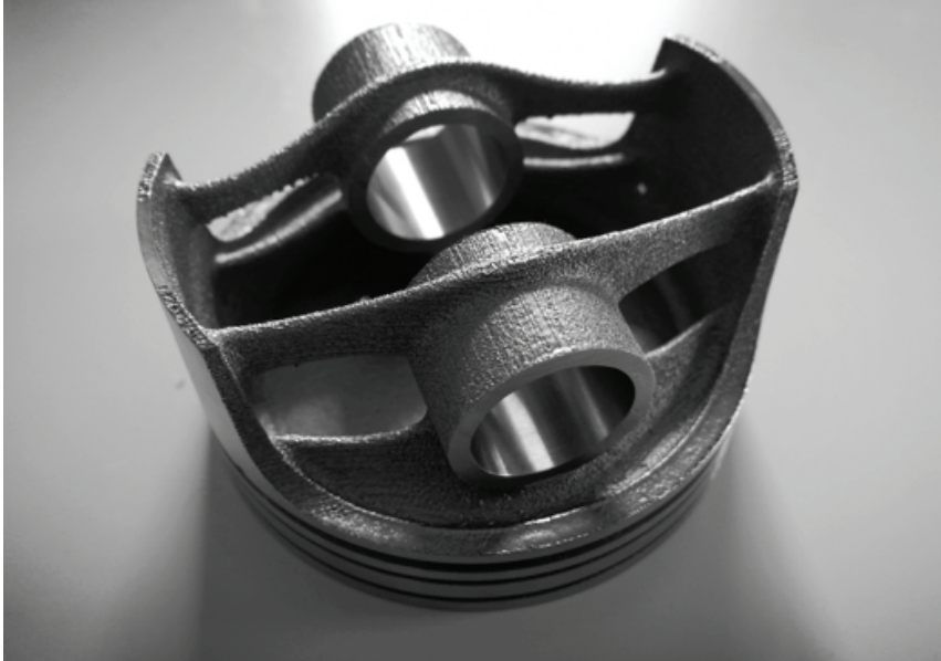
Final titanium printed piston

“Using Inspire, I can design products that are lighter and just as strong, if not stronger than their counterparts. The organic shapes created in Inspire are perfectly suited for additive manufacturing.”