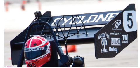
Full wing Structure including Optimized Swan neck Mounts