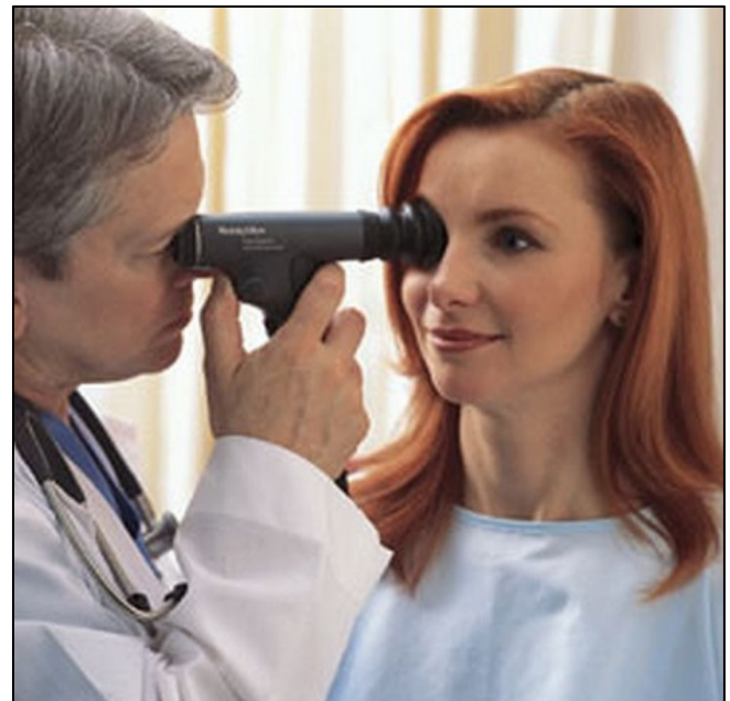
Figure 4: Welch Allyn Panoptic Ophthalmoscope with Half Moon Aperture