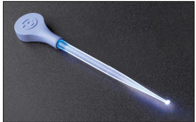
Figure 3: Lighted Ear Curette

TracePro's intuitive design environment, combined with interactive 2D/3D design optimization, visualization and photorealistic rendering capabilities, and award-winning performance and accuracy, helps produce highly successful designs.