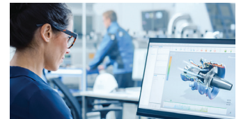
Historical reports that reveal long-term usage behavior