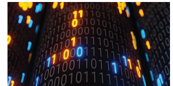
Performance optimization for even the largest deployments