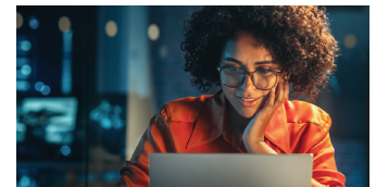
Streamlined license file administration