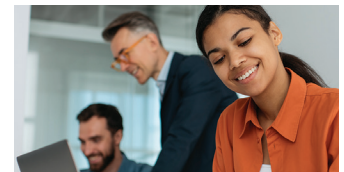
Tight integration for streamlined job scheduling

Managing software licenses efficiently is crucial for organizations that want to optimize costs and ensure compliance.