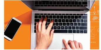
Comprehensive real-time reporting for all licenses