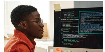
Scalability to handle the biggest, most complex workloads

To learn more, please visit altair.com/monitor