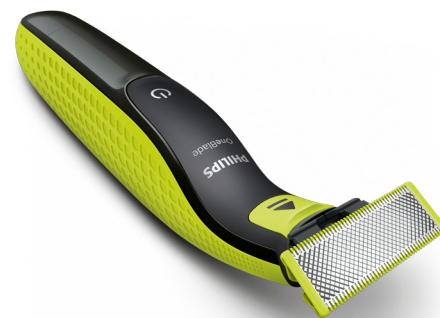
Final Philips OneBlade Product