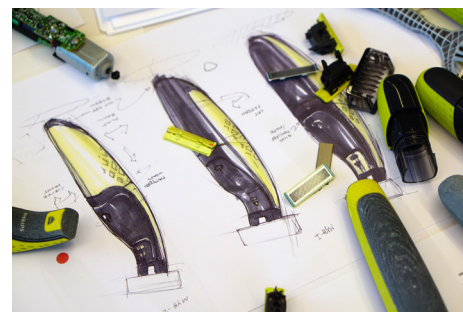
Initial Sketches and prototypes of Philips OneBlade

Jens has become extremely productive in solidThinking Evolve, he has already used it on multiple products that are on the market including the Philips OneBlade, the Philips Health Watch, and the Philips Bodygroom series 1000. Jens noted, "Working in the collaboration-driven environment of Philips design demands tools that I can depend on to help deliver great products to market quickly. Evolve in particular is a powerful software for enabling designs in our fast-paced development environment. It helps me gain speed not only in bringing design concepts to life, but also in driving fast iteration loops with the development team. I especially appreciate the construction history as consumer product development can be a moving target as consumer insight and feasibility is constantly effecting the design. Evolve's features allow us to intuitively adjust the design throughout the process, generating options and visualizing solutions quickly to keep the design intent intact. Evolve is striking the perfect balance between a conceptual design software and a rigid engineering package. It has the power of construction history and surface control but also allowing conceptual modeling without being too inflexible." Jens is planning to continue his usage of Evolve while also encouraging and teaching colleagues at Philips Design to learn the tool.