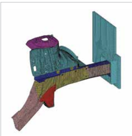
RADIOSS Crash Model

Traditionally the simulation engineer uses idealized component data simply because validated data for the manufacturing process is not yet available. This approach could lead to a different behavior in the actual test than theoretically predicted in the simulation due to components potentially experiencing different stresses, strains and thicknesses and other material characteristics from its manufacturing process. To achieve a higher