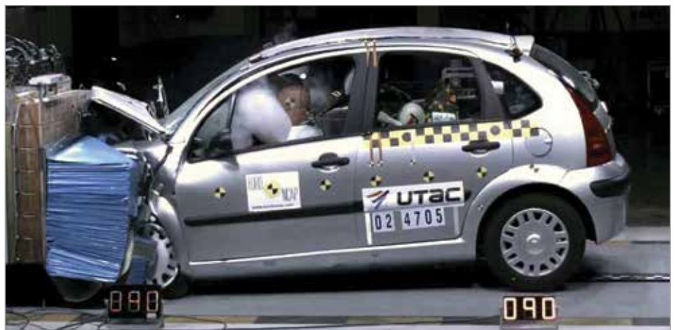
Reference Design: 0,008 Sec Simulation Time