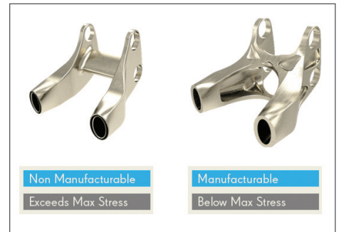
Before and after comparison of brackets