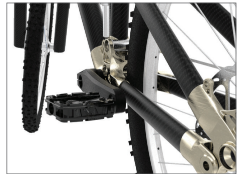
Rendering of final bike and nodes