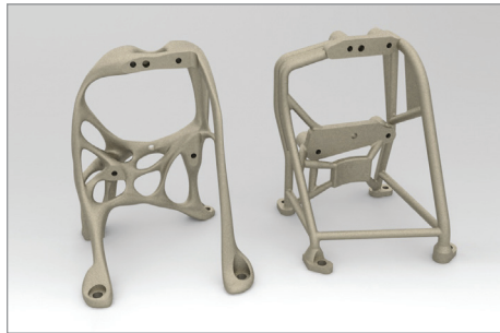
Optimized and 3D printed metal aerospace bracket