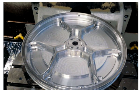
Wheel rim in the milling manufacturing step