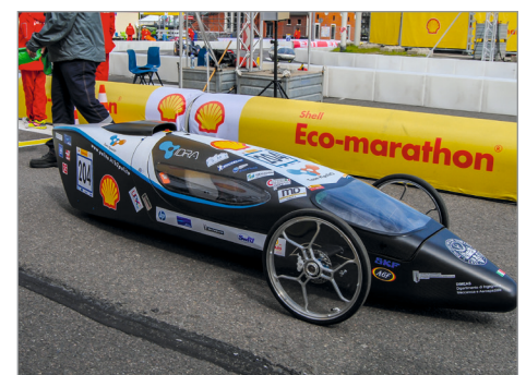
The Prototype IDRA - hydrogen fuel cell category- at the Shell Eco-marathon.

“Our main goal is to participate in the Shell Eco-marathon with a great car and possibly win the competition. We are striving to share the Shell Eco-marathon values by combining a sustainable development with a vehicle that uses the least possible amount of energy, and HyperWorks did a great deal to support this effort. We believe that the competition is a perfect way to achieve excellence. It gives us the possibility to work hard in order to challenge the competitors and to produce a more advanced technology vehicle that could become benchmark for its category.”