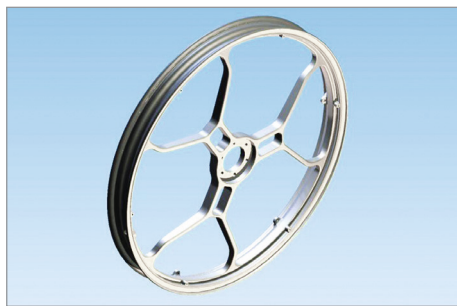
CAD model built in solidThinking Inspire